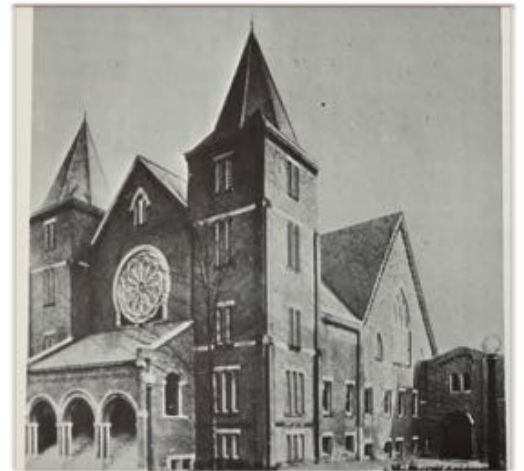
Chandler Street Church