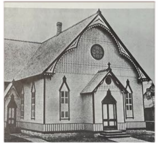
Our second church was built with gingerbread architecture and wooden sidewalks.