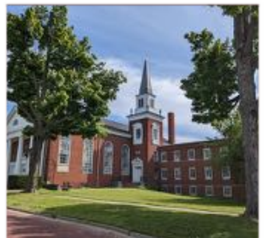
First Covenant Today